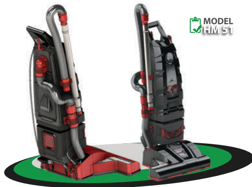
MODEL HM 51