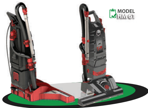
MODEL HM 61