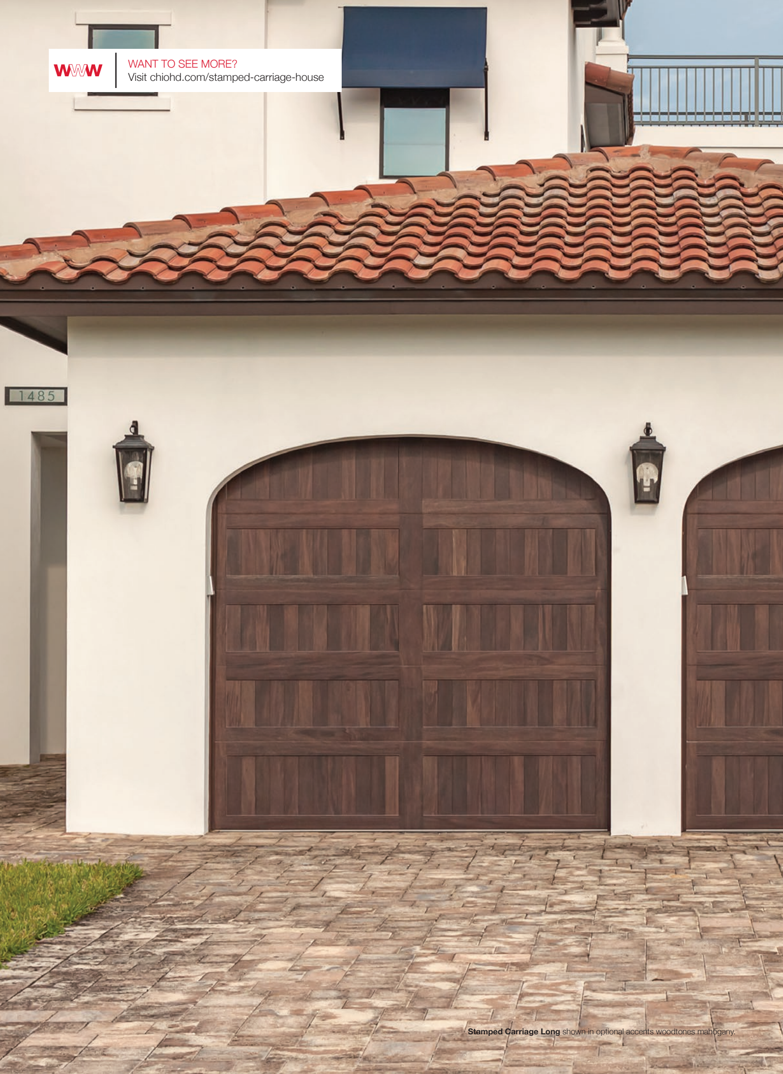
Stamped Carriage Long shown in optional accents woodtones mahogany.

WANT TO SEE MORE? Visit chiohd.com/stamped-carriage-house