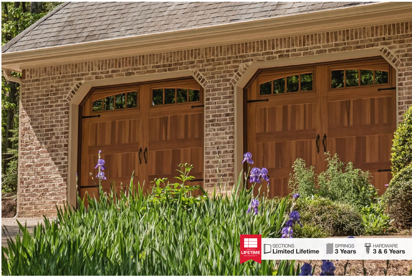
Stamped Carriage Short shown in accents woodtones cedar with optional arched madison inserts, tinted glass, and barcelona 1 hardware.