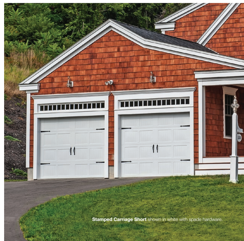
Stamped Carriage Short shown in white with spade hardware.