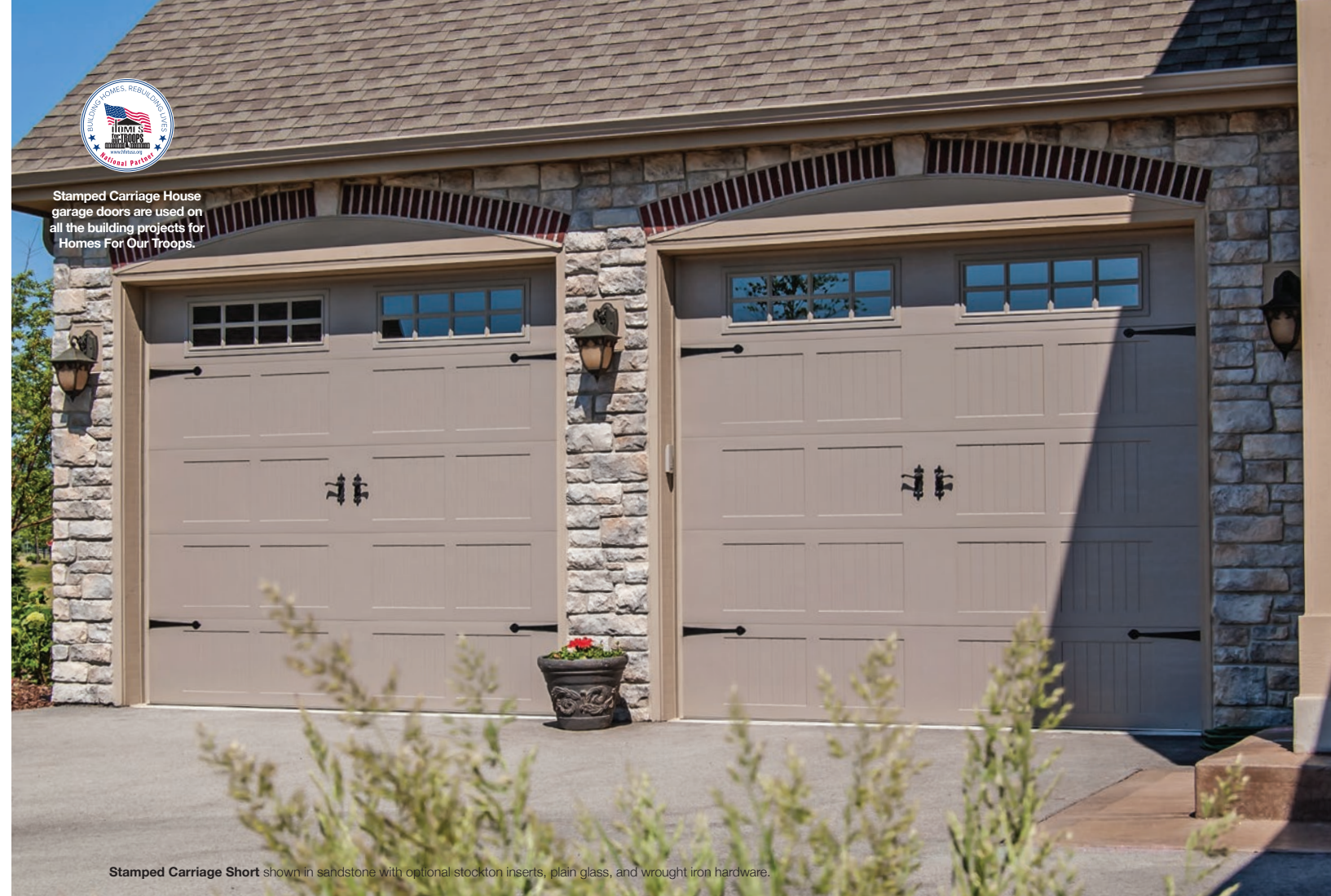
Stamped Carriage Short shown in sandstone with optional stockton inserts, plain glass, and wrought iron hardware.