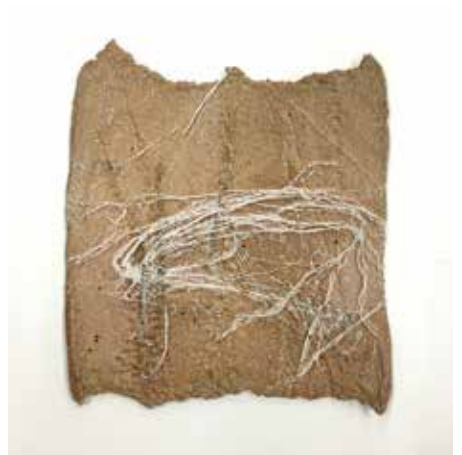
Bamboo ash on clay

symbol for radiation. Using a wood kiln was also essential to the project. It was a deliberate and symbolic act to bring actual fibres from the Hiroshima trees back to the flames - to commemorate the conditions they had endured.