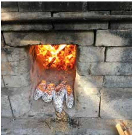
Wood kiln firing October 2018