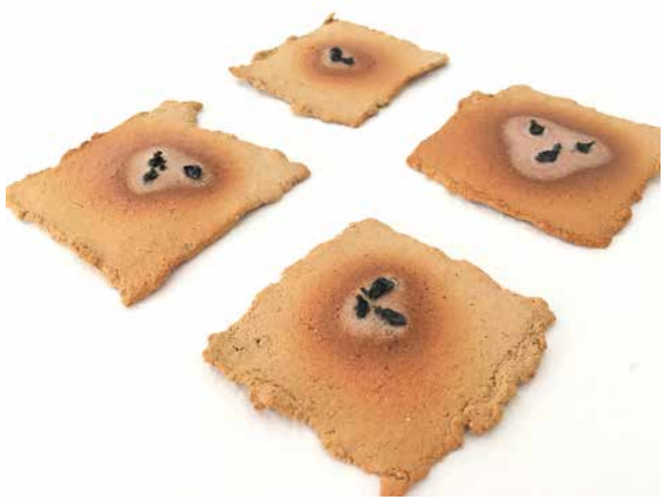
Camellia (Tsubaki) buds fired on clay