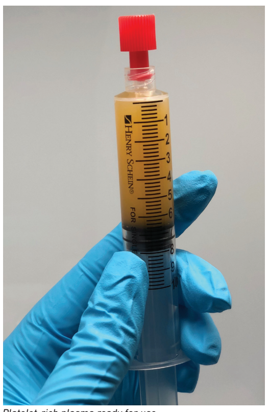
Platelet-rich plasma ready for use.

PRP therapy has been in clinical use since the 1990s (42). PRP is prepared from autologous blood by using centrifuge density-separation and removal of the red blood cells, and then further concentrating the platelet rich fraction of the remaining plasma. Platelets activate (degranulate) when they contact air, broken fragments of collagen (such as at the site of damaged tissue) or sense another platelet in proximity undergoing degranulation. When platelets degranulate they release alpha granules that contain up to hundreds of cytokines and chemical messengers that signal for inflammation and stimulate the body's endogenous repair mechanisms.