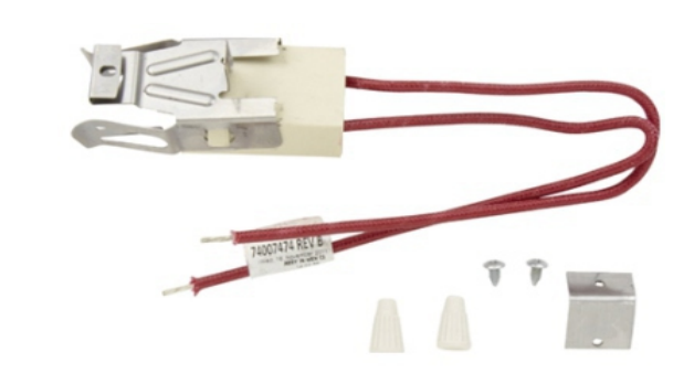
Universal White Porcelain Terminal Block