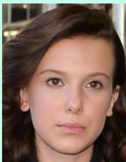
Millie Bobby Brown

POTUS . An unknown President of the United States. Main voice behind the push to hide the Earth from interference.