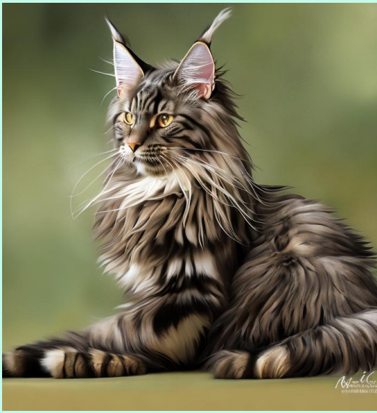
Ensign Dax chilling as a Maine Coon Cat.