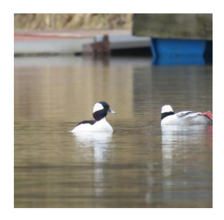
Bufflehead Ducks! ~ On Horseshoe Lake