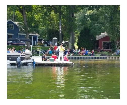
Party on Woodbeck with Elvis 2021

Follow us and Like Us on Facebook: <u>https://www.facebook.com/WoodbeckChainofLakes</u> Follow us on Instagram: #woodbeckchainoflakes Visit our Website: <u>https://woodbeckchainoflakes.com/</u> Contact us: Email: <u>woodbeckchainoflakesmi@gmail.com</u> Phone: 616-894-0938