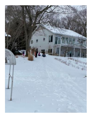
Winter Fun with the Birds on Banks in February 2022