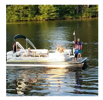
4^{\text{th}} of July Parade 2021