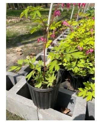
For more information on Lakeside Perennials see their sponsored ad on page 13