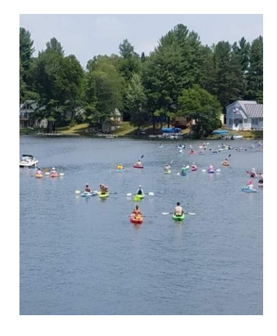
Progressive Kayak Event back in 2020!!