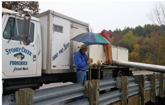
Rain, snow or shine, the fish are in...thanks Stoney Creek Fisheries!

The WCLA will promote the preservation of lake/water quality, provide education about boat safety & etiquette and initiate social activities to promote community friendships and interaction. It will encourage membership and participation in the Association and will facilitate a sense of community amongst riparian property owners.