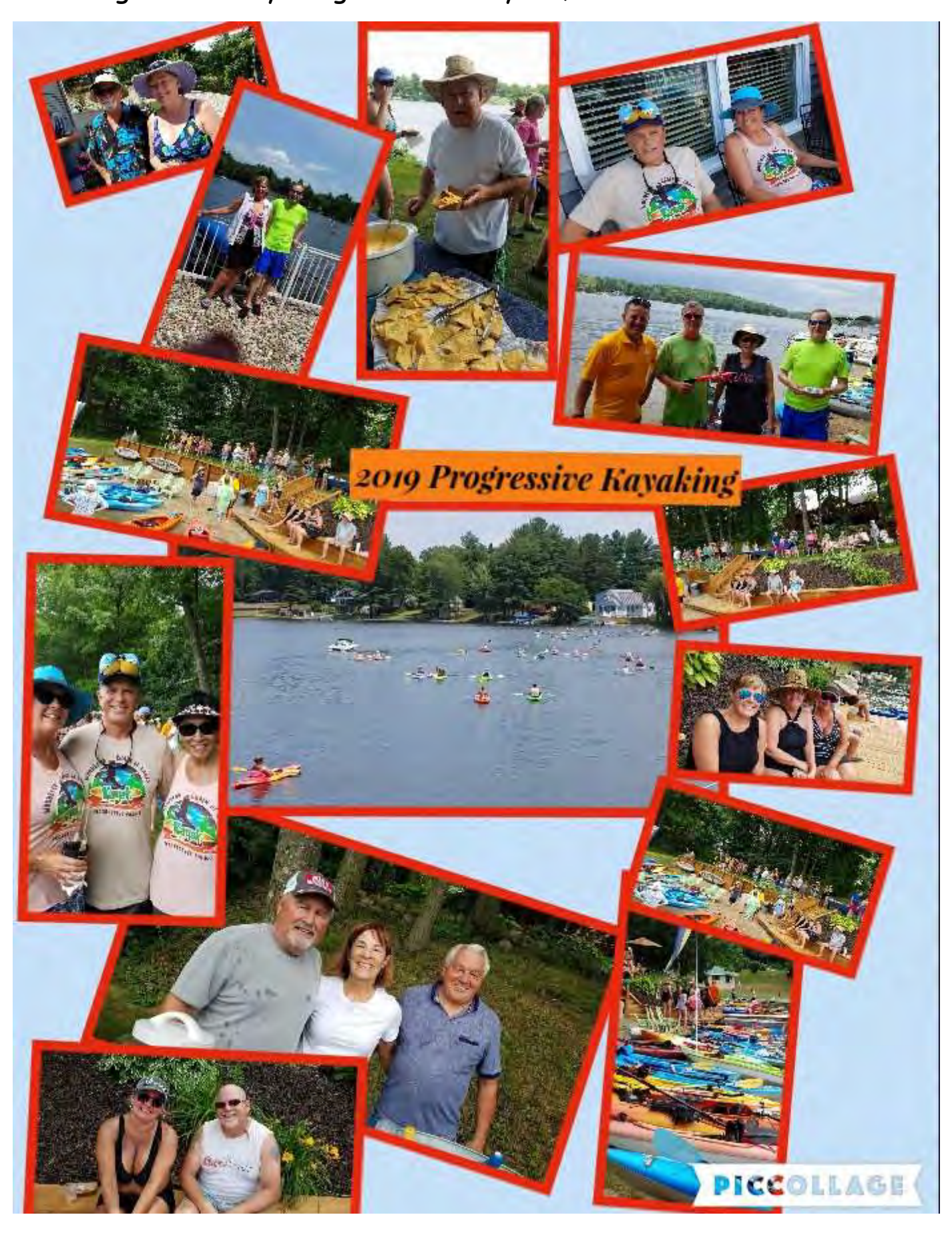
2019 Progressive Kayaking Event - July 20, 2019