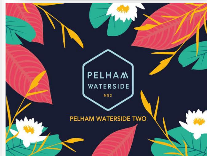
Maythorn House Trent Lane, Nottingham NG2 4DS