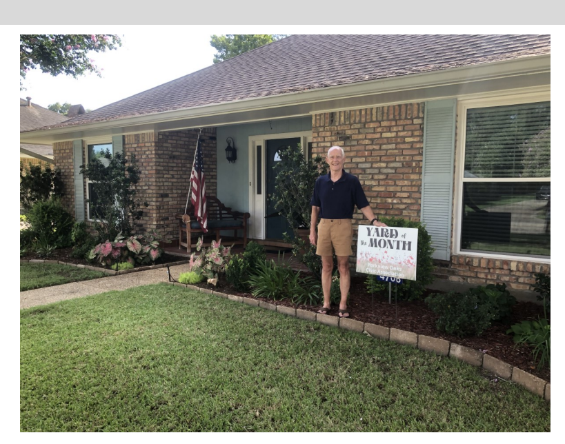
August Yard of the Month