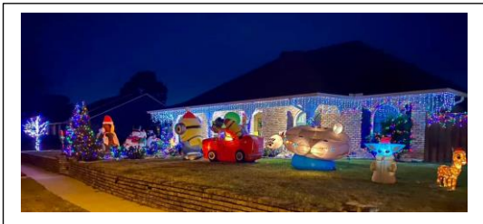
1ST Place – The Yoanis Family