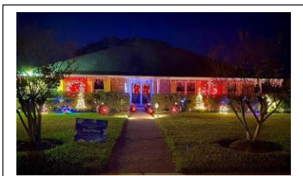
2nd Place – The Angelos Family