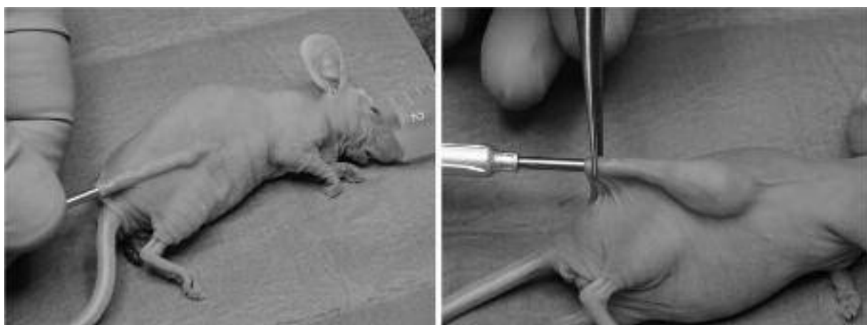
Figure 1. Fat injection.

(TR = 842 ms, TE = 8.64 ms, matrix = 256x256, thickness = 2 mm slice, slide number = 18). The MRI study was conducted 1 day after implantation, after 22 and 43 days.