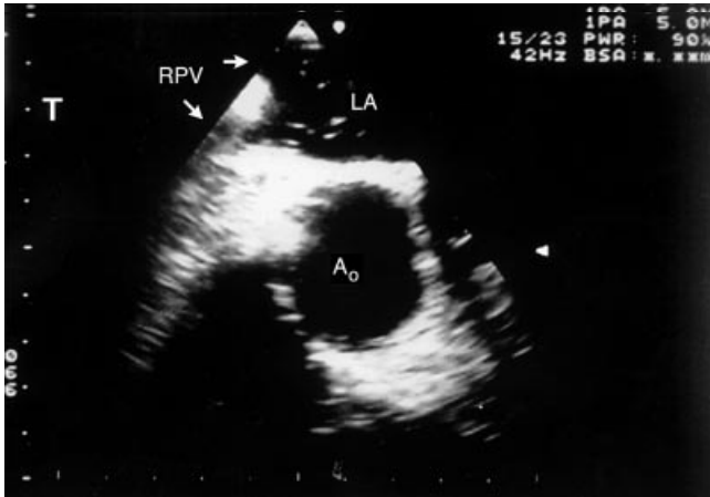
Fig 1 Short-axis view at the level of mid-oesophagus transoesophageal echocardiogram showing the right pulmonary vein (RPV), left atrium (LA), and aorta (AO). About 5 min after the reduction of end-tidal \text{CO}_2 , air bubbles were seen within the RPV as they entered the LA, indicating a right-to-left pulmonary shunt.