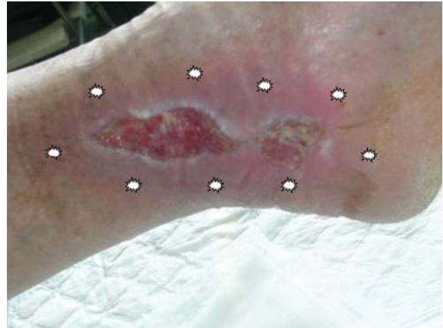
Figure 2. Treatment at the site of the lesion. Injection sites: circumferentially, 2 cm from the area of perilesional inflammation.

Based on the data recorded using the PeriFlux System 5040, the analysis of the TcPO 2 in group A showed an increase in mean values from 21.55 mmHg to 41.18 mmHg, with p < 0.001 (Table III), while in group B, the mean increased from 22.15 mmHg to 32.54 mmHg, not showing statistically significant p -values. Only in group A (treated with CO 2 therapy) changes in the signals observed using the Laser Doppler technique demonstrate a significant increase in the values (expressed in PU) observed after treatment. In this group, the means of the values observed before and after CO 2 treatment were 11.21 (standard error (SE)=1.70) and 26.09 (SE=3.49) respectively ( p=0.003 ). This confirmed the