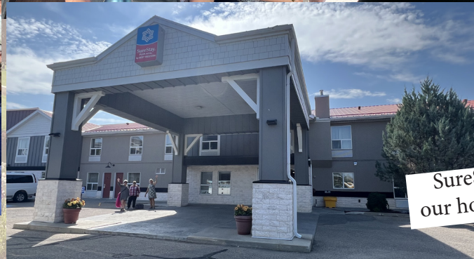
SureStay Drumheller, our home for two nights.