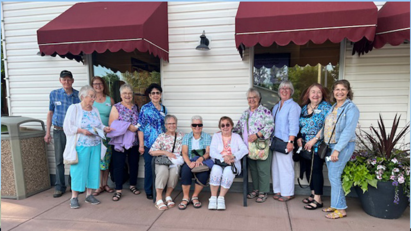
Our 2025 Drumheller Bus Tour group...