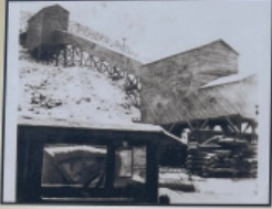
Arcadia Mine #2

The visible red shale dump 600m southeast from this sign is all that remains of the Arcadia Mine. During its peak, the Arcadia Mine employed over 100 men, most of whom lived in the now-abandoned town of Arcadia - approximately 500 m east of the Hoodoos Recreation Area and Willow Creek, about 1.5 km southwest of this site.