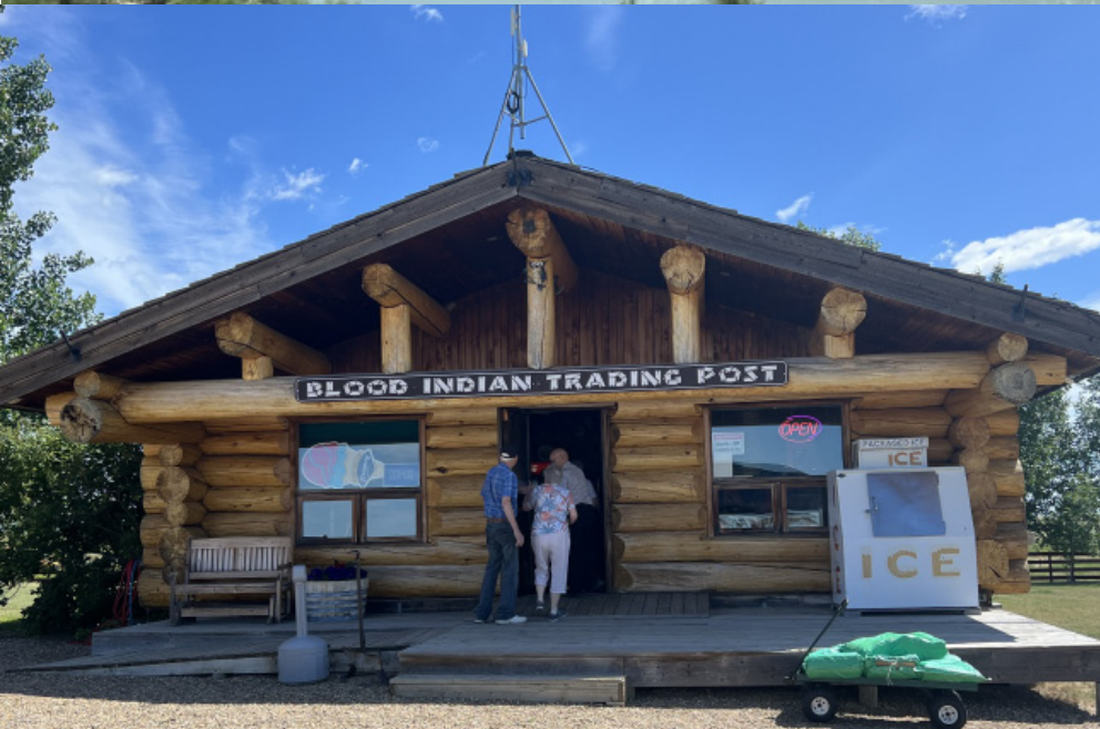
Had to stop for ice cream...