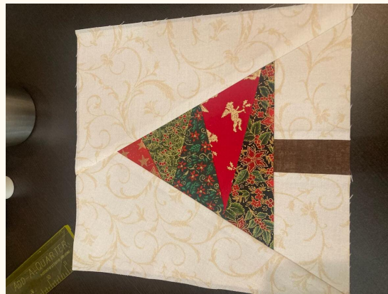
Sorry! The Christmas tree just won't flip upright!