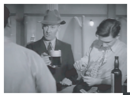
There is a scene of the two meeting for the first time at a bar in Galveston.

Fletcher: (gets a beer from the bartender and looks at it) "Bit of a collar on it, isn't there?" Bartender: "Sure is." Fletcher: (takes a sip) "Muck!"