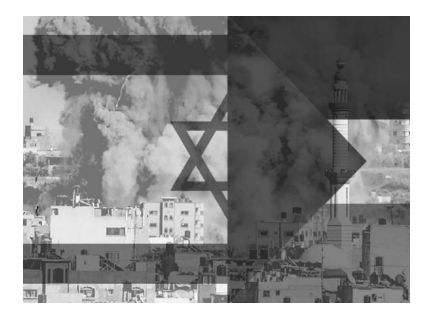
Israel and Palestine have a history of conflict since the 1800s that has resulted in unrest, riots, etc.