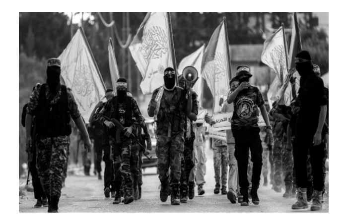
Hamas is a conservative Sunni Muslim group that has controlled Gaza since 2007.