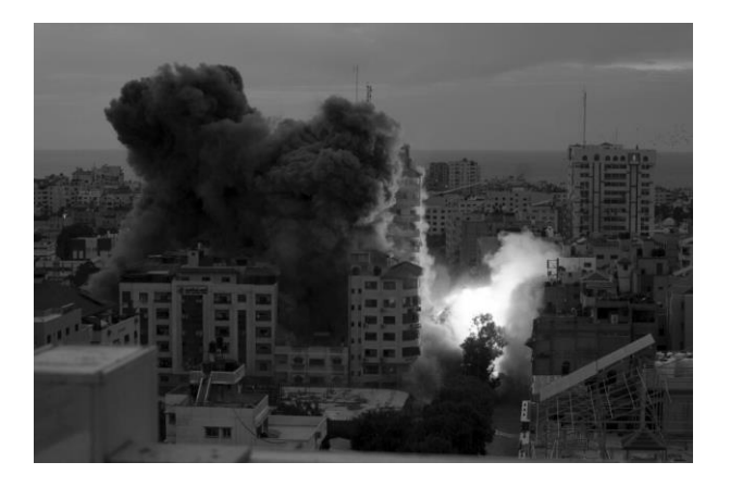
Hamas staged a surprise attack against Israel on October 7, 2023.