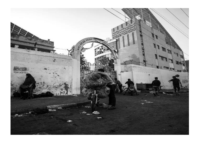
Israel performed retaliation attacks that destroyed a hospital and began a ground invasion in Gaza.