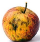
Box Store Valves