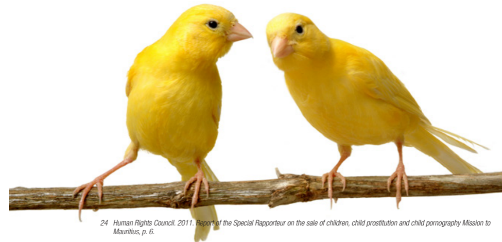
24 Human Rights Council. 2011. Report of the Special Rapporteur on the sale of children, child prostitution and child pornography Mission to Mauritius, p. 6.

The move to introduce comprehensive sexual education in Mauritian schools has faced the challenge of conservative cultural values and sensitivity around sex and sexuality, and reluctance by teachers to teach topics with which they themselves are uncomfortable.