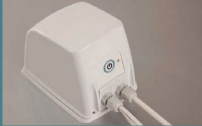
Flow Connect Transformer SDS081T