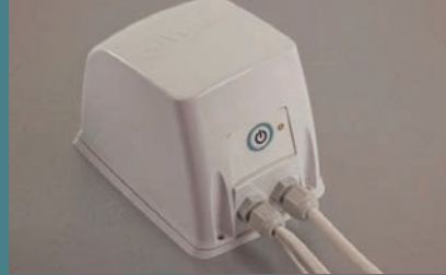
Instant Match® Transformer SDS131T