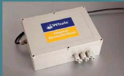
Digital Smoothflow Control Box SDS243T