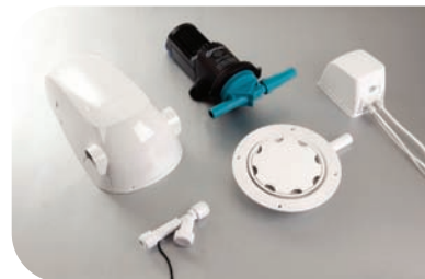
Flow Connect Wet floor Gulley Kit BP1578