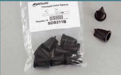
Tricuspid Valves SDS211B X10