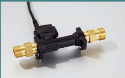
Venturi Flow Sensor SDS223T