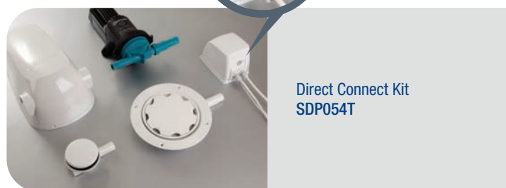
Direct Connect Kit SDP054T