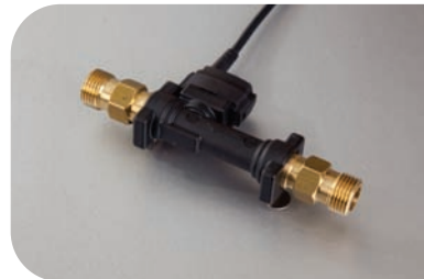
Venturi Flow Sensor SDS223T