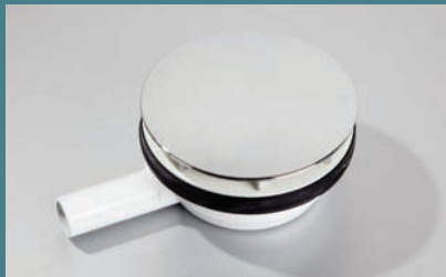
90mm Gully AK1695