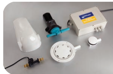
Digital Smoothflow Kit SDP113T