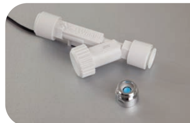
Mixer Valve Conversion Kit AK1570