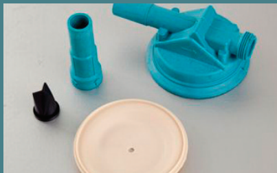
Spare Pump Head Kit SDS071T