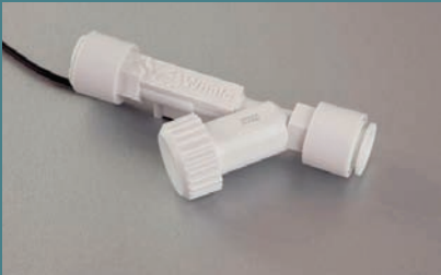
Flow Switch AK1568