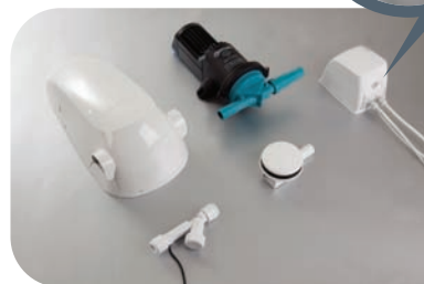
Flow Connect Tray Gulley Kit BP1558B