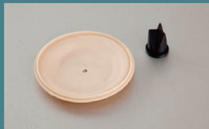
Diaphragm/Valve Kit SDS061T