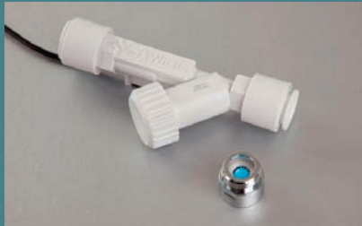
Automatic Mixer Valve Conversion Kit AK1570