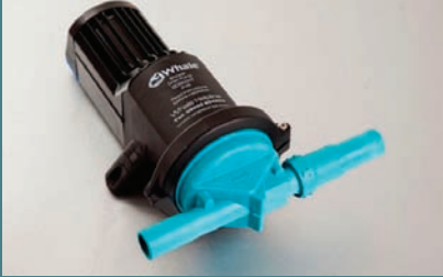
Shower Drain Pump SDS021T