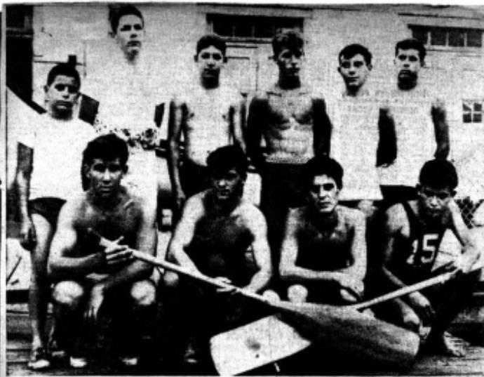
Herald Statesman Monday, July 2, 1973

(source https://http://www.yprc.org/yprc-history.html )