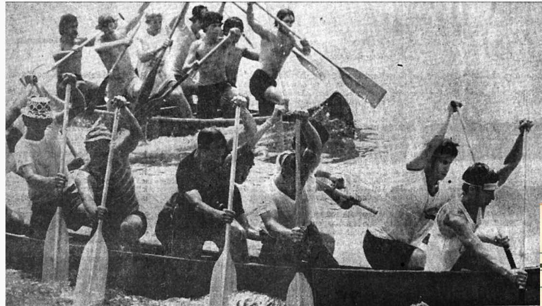
IT'S DOWN TO THE SEA IN CANOES AS THE 2ND ANNUAL HUDSON RIVER CANOE REGATTA HITS THE WATER ... War Canoe Race between civic organizations was one of the highlights of the day's festivities