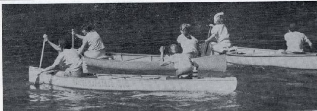
Weeks of training come to a climax as six girls begin their flight to Monterey down the swift and many times harsh Tippecanoe River. Six miles of whirlpools, log jams and rapids were conquered at the cost of a few sore muscles.

Here many of the more inexperienced discovered that the water was also unusually cold and that the required life jackets were really a good idea.