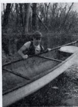
An Indianapolis canoeist rights his canoe on a log jam.