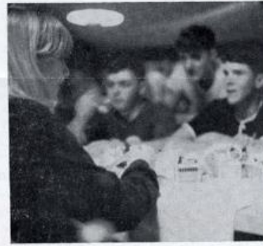
Warm fire and food at the finish line helped canoeists tell their adventures to the girls.