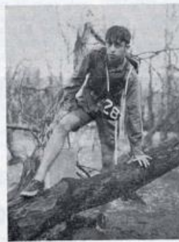
His partner ships as help and extrication arrive on the scene.