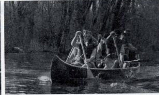
Beginning paddlers surprised themselves in what they could learn of canoeing and exertion on the 30-mile wilderness marathon.