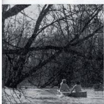
Wildly beautiful, the river banks sometimes misled unsuspecting paddlers as they darted along.