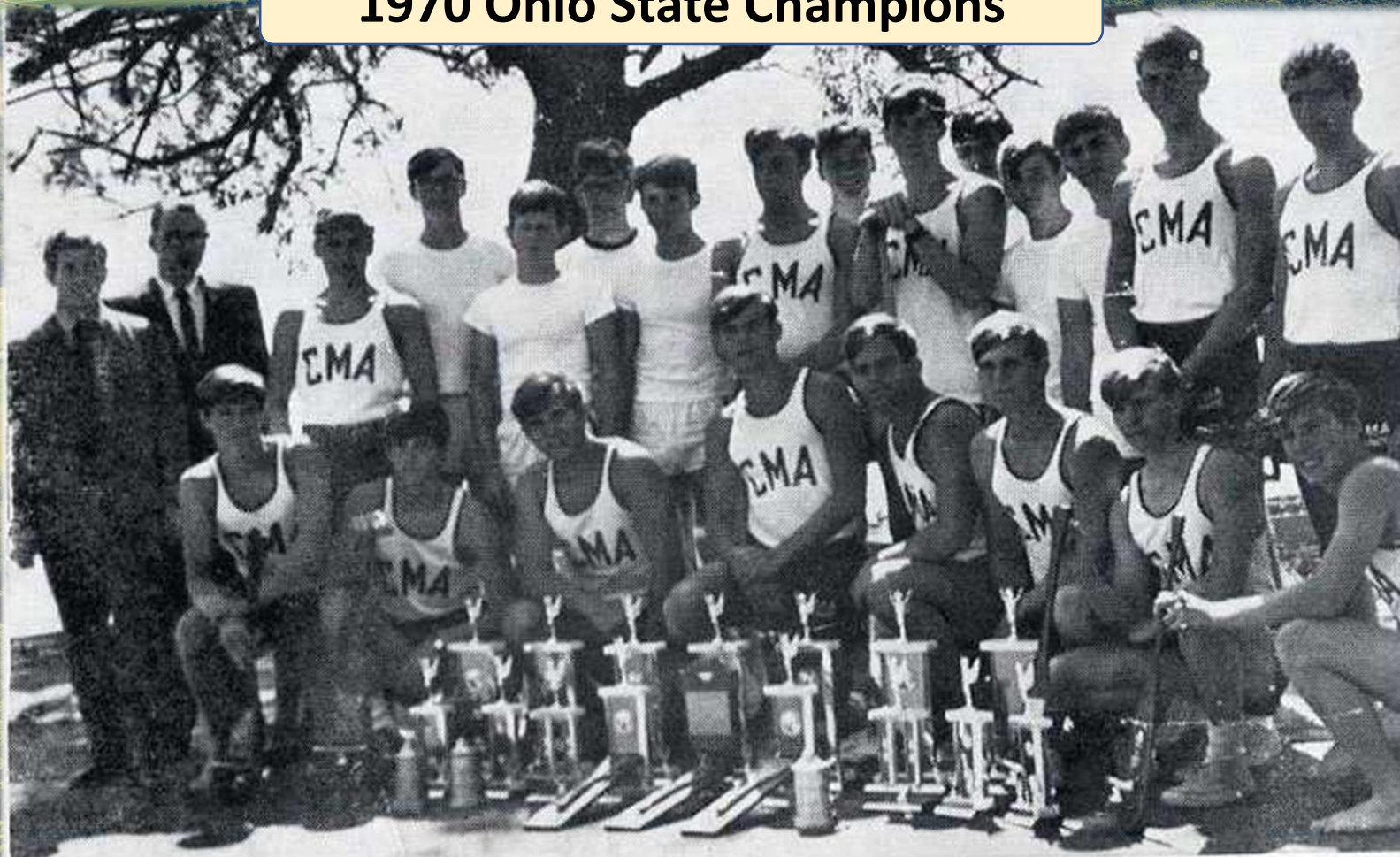
The canoe team proudly displays their trophies. See "Sports wrap-up"