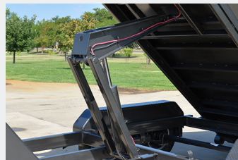
14K Scissor Lift Hoist