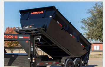
45° Dump Pitch