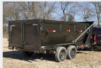
13.63 Cu yd Capacity Bin