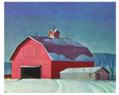
4. So he opened the barn doors. But the birds were afraid, and would not go in.