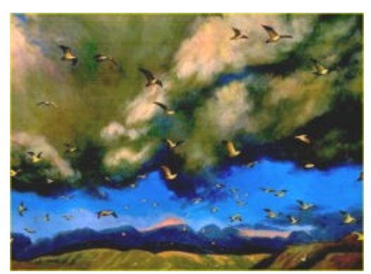
1. There was an old farmer who noticed a flock of birds in the middle of winter.