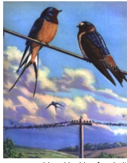
2. They were cold and looking for shelter. A winter storm was coming and they could freeze to death.