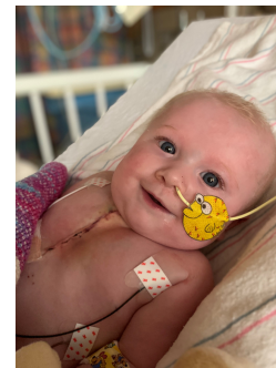
Victoria Ciara Foundation