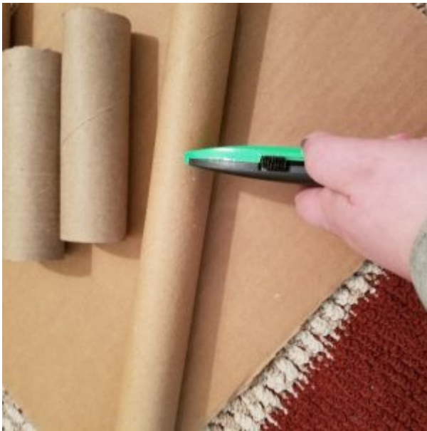
Step 1 – Take the cardboard tubes and cut them into a variety of different heights.