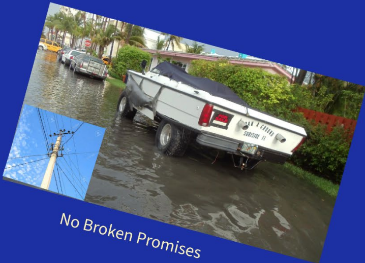
No Broken Promises