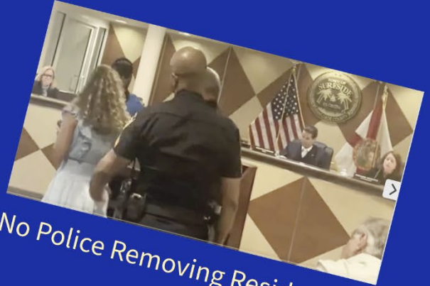
No Police Removing Residents