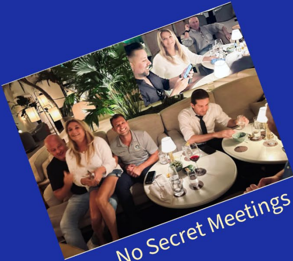
No Secret Meetings