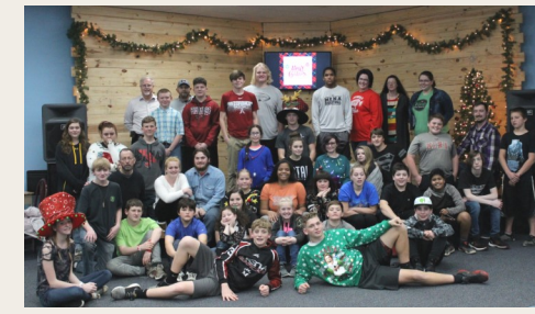
Youth Christmas Party - December 19th