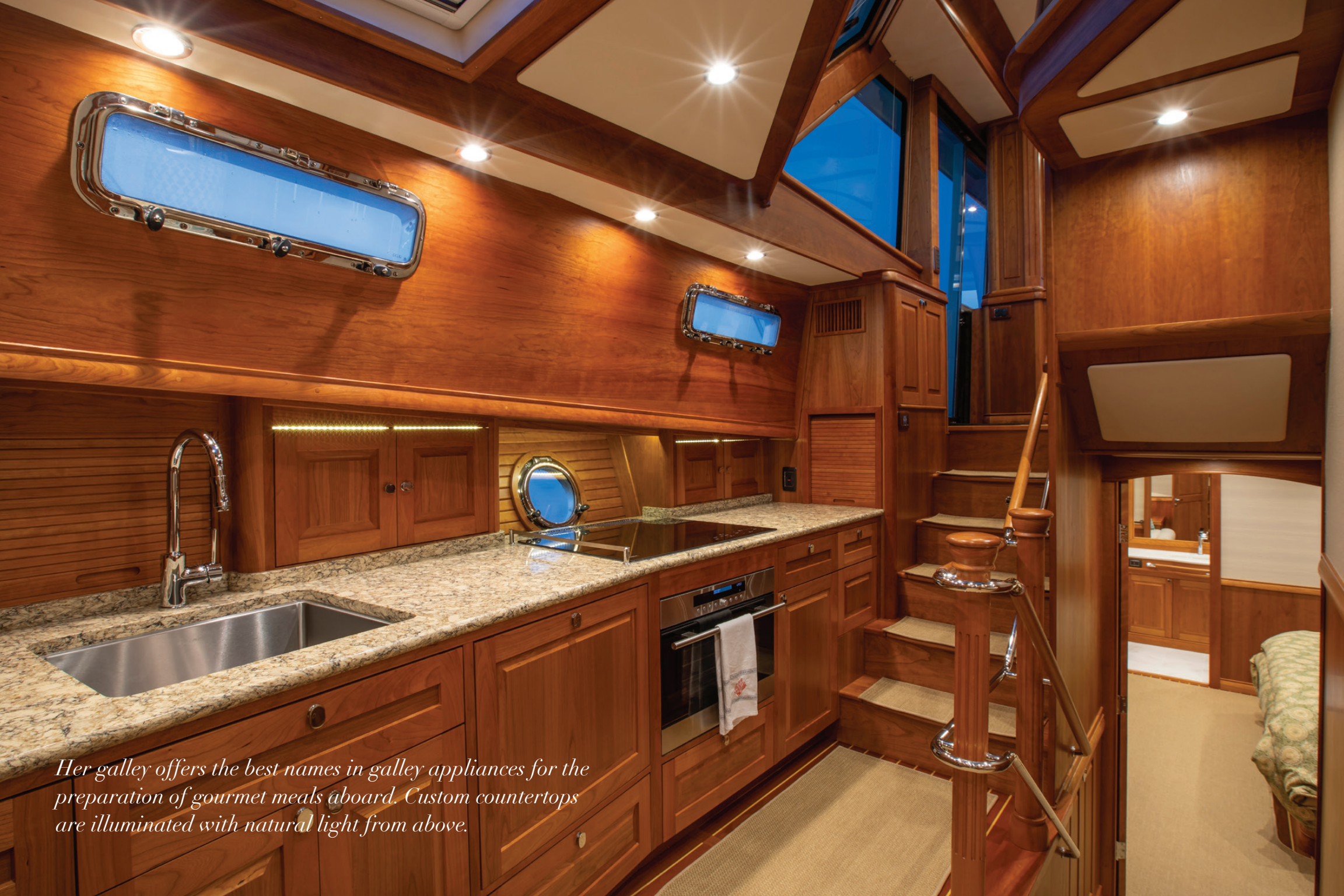
Her galley offers the best names in galley appliances for the preparation of gourmet meals aboard. Custom countertops are illuminated with natural light from above.