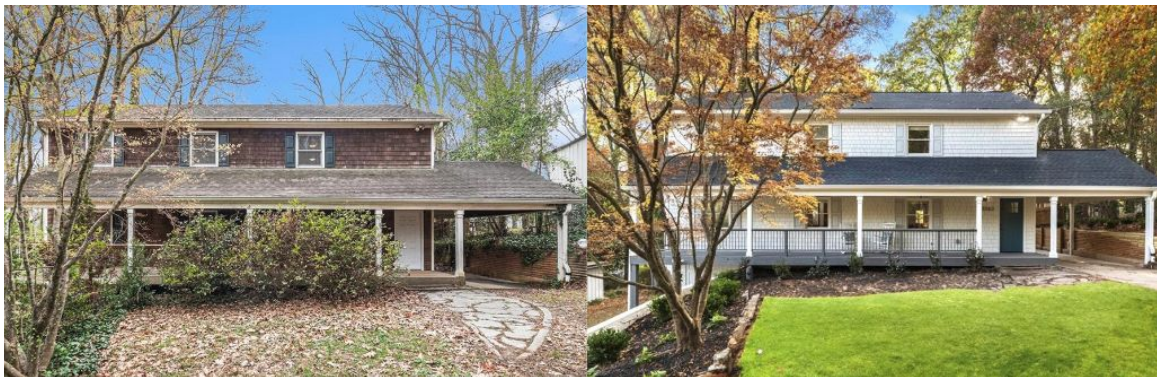
Before | After