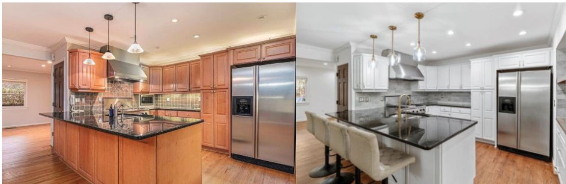
Before | After