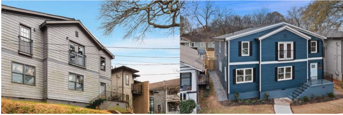
Before | After