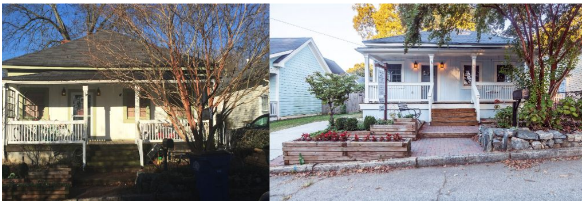
Before | After