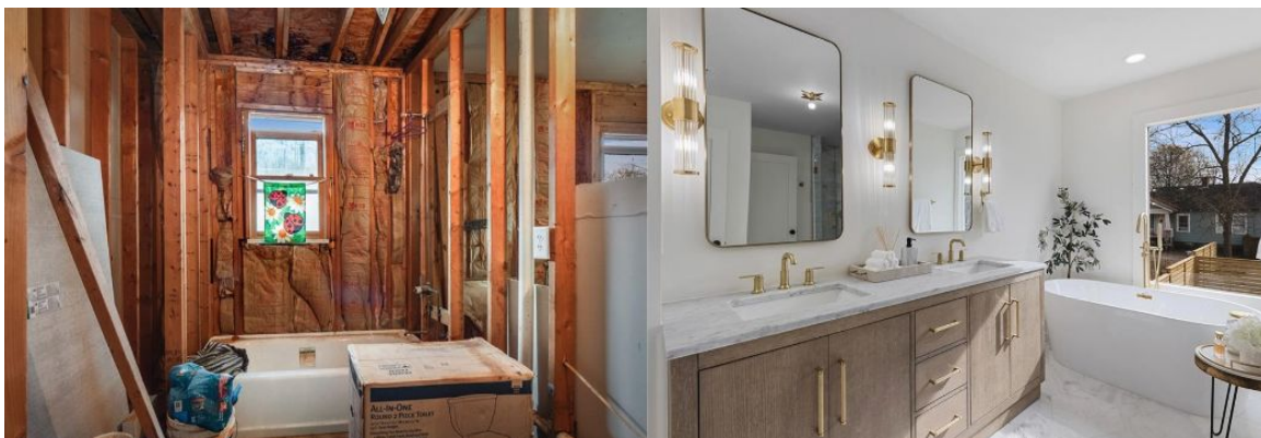
Before | After