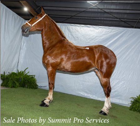
Sale Photos by Summit Pro Services