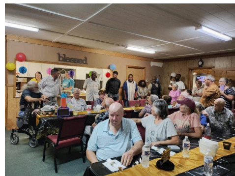
Right: Many gather to celebrate the milestone with a meal.