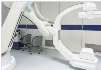
Medical (X-Ray & Imaging Equipments)