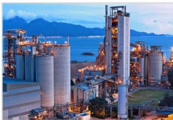
Cement, Mining & Minerals