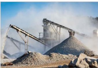
Cranes & Conveyors