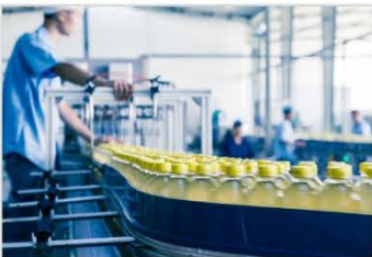
Bottling, Canning & Packaging