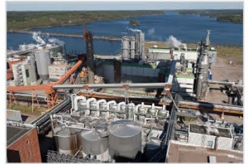
Process Industry (Fertiliser, Sugar, Paper & Pulp)