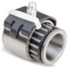
Bottom Roller Bearings

Range : Stud Type: KR, KRV series Yoke Type: NATV, NATR, NUTR series