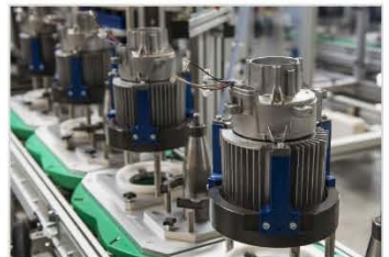
Industrial Electrical (Electric Motors & Circuit Breakers)