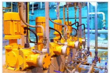
Fluid Machinery (Pumps, Fans & Blowers)