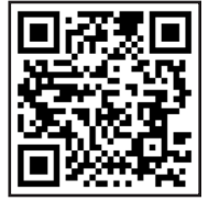
Portfolio Website QR