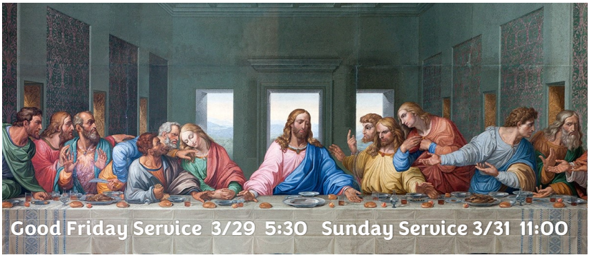
Good Friday Service 3/29 5:30 Sunday Service 3/31 11:00