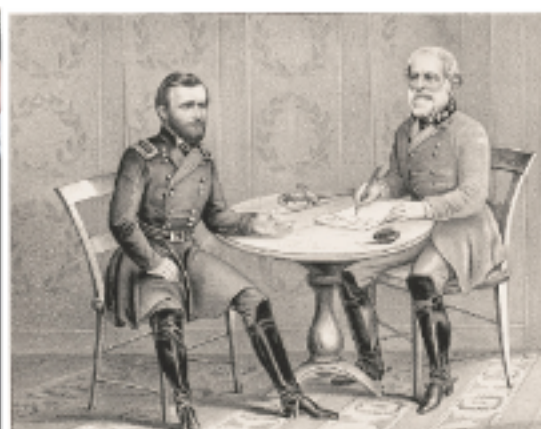
Surrender of General Lee - at Appomattox, C.H. Va. April 9th 1865