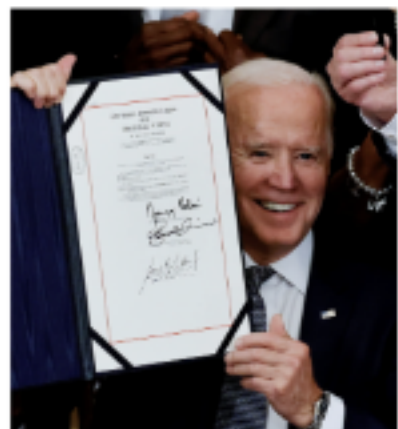
Signing ceremony of S.475 in the East Room of the White House in Washington

It took another two months before the enslaved African-Americans, as far as Galveston, Texas, were informed of their Emancipation on June 19th, 1865. This announcement was the foundation and beginning of Juneteenth. Ironically, even after being freed from slavery by the Emancipation Proclamation in 1863, that proclamation was not ratified by Congress until December 6th, 1865, with the 13th Amendment to the Constitution abolishing slavery throughout the United States. Still, June 19th, "Juneteenth," is the most popular date to celebrate the holiday, emancipating African-Americans from enslavement.