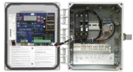
Above: Simplex - Below: Duplex