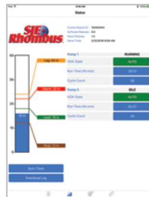
EZ Connect™ Mobile App