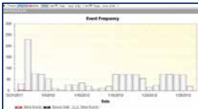
Daily Events Screen summarizes all events occurring daily