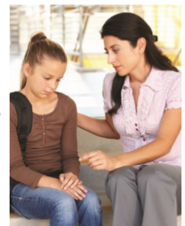
Point 6: Teaching Secrets"

even children who understand and practice touching safety. It is not uncommon for children to keep abuse hidden, and child molesters rely on this secrecy.