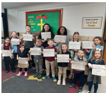
December Saintly Students: Practicing Patience.