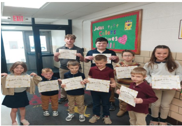
April Saintly Students of the month Sacred Heart School.