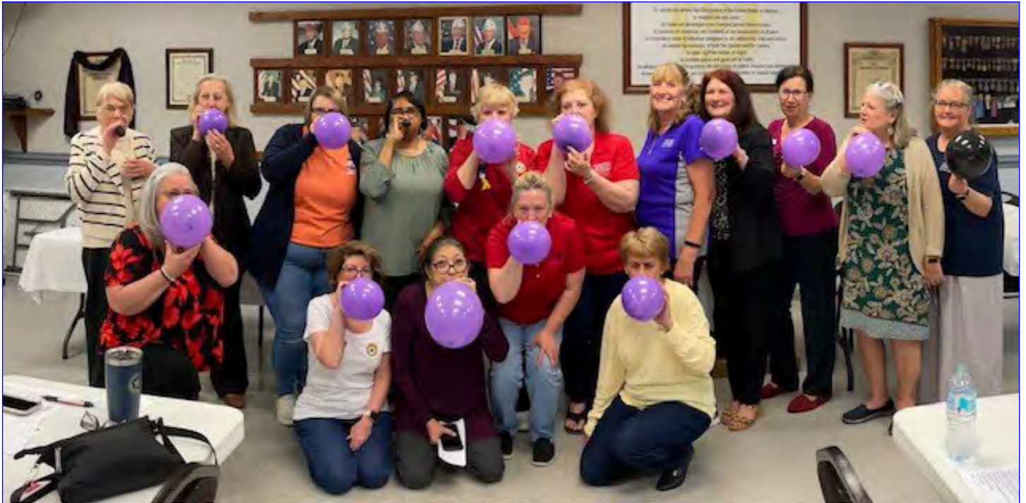
The members of Auxiliary Unit 284 “purple it up” for the Month of the Military Child at the March meeting.

“ Leadership is not about having a title, but it’s about making others better because of our presence and making sure that impact lasts in your absence.”