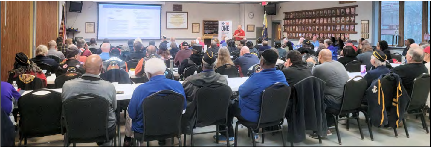
Including the instructors, a total of 105 persons attended the Department of Virginia's first regional American Legion College at Post 284, March 7. The Legion College for the Eastern Region was conducted first, followed by the Northern Region at Springfield Post 176 on March 14 and the Western Region at Salem Post 3 on March 21.