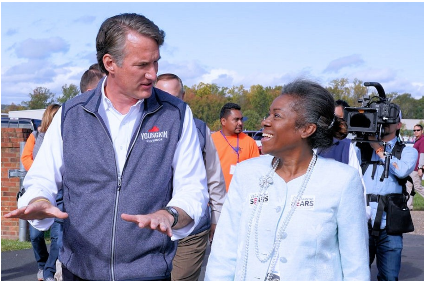
Governor Glenn Youngkin and Lt. Gov. Winsome Earle-Sears announce 30,000 Virginia veterans register to use free resource.