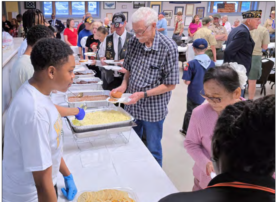
Members of Huguenot High School Army Junior ROTC served lunch to the attendees following the ceremony. Lunch consisted of hamburgers, hot dogs, baked beans, potato salad, cookie and a drink.

Cadets from Huguenot High School Army Junior ROTC again served lunch to attendees at this year's ceremony. The lunch consisted of hamburgers, hot dogs, baked beans, potato salad, cookie and a drink.