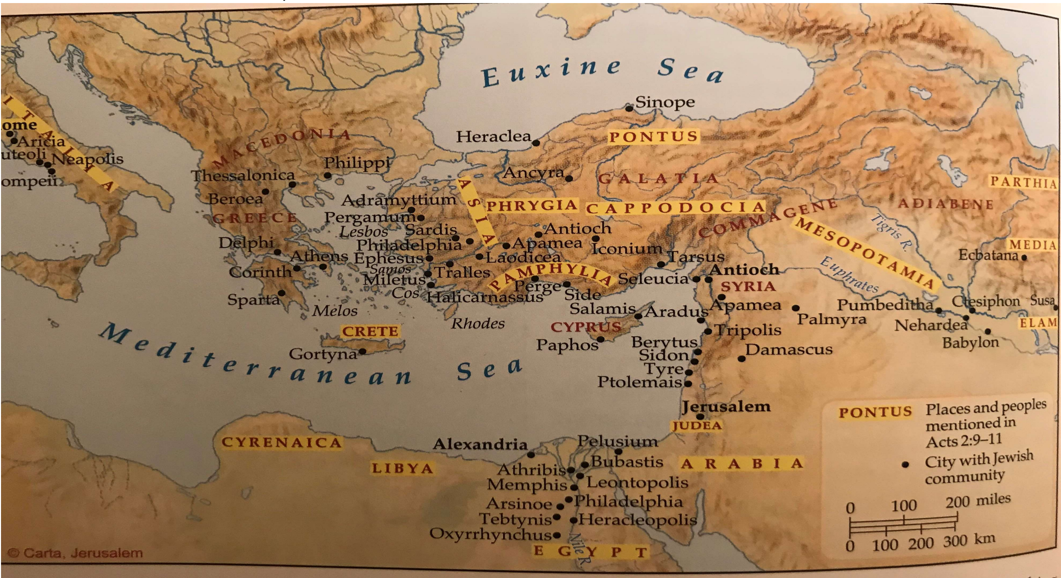
A Map of Mediterranean