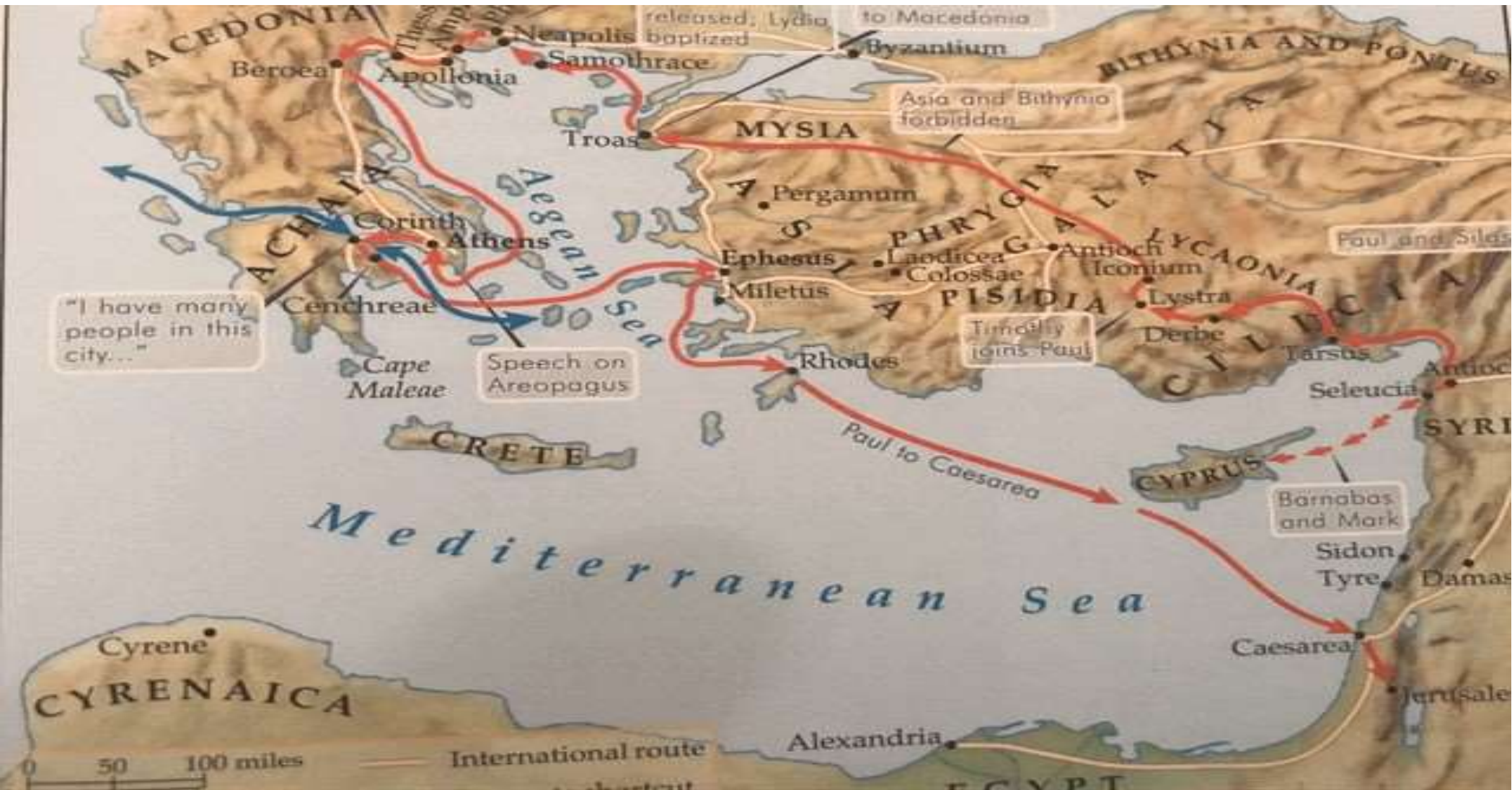
MAP G Second Apostolic Journey: Acts 15:36-18:22