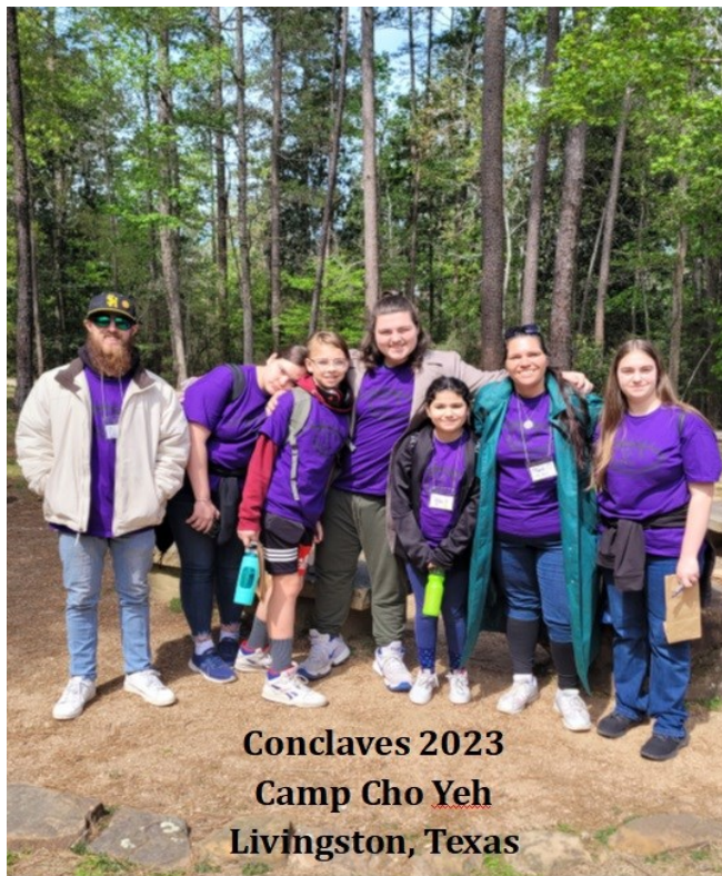
Conclaves 2023 Camp Cho Yeh Livingston, Texas