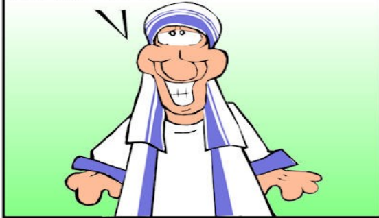
Mother Theresa speaking a great truth of perspective for life.

God does not demand we be SUCCESSFUL , God demands we be FAITHFUL!